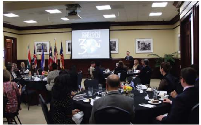
Fellows Banquet 2016