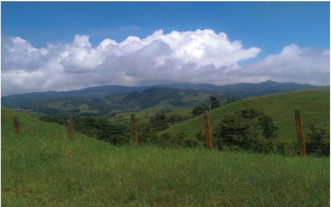
Mountain view on the drive from Lake Arenal to Monteverde, Costa Rica.