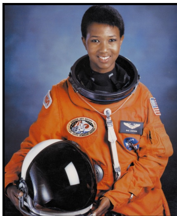
Dr. Mae Jemison

The IEO division of the L.T. Jordan Institute brings cultural presentations to elementary schools in the Bryan/College Station community in an effort to foster international awareness, understanding and cultural sensitivity at a young age.