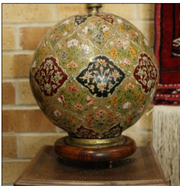
NOT YOUR USUAL LAMP — One of the most unique and ornate items of the Collection, this lamp is made from a camel's bladder.

The Jordan Institute Collection explores culture through the universal language of art